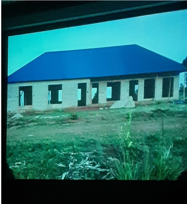
“A new school under construction”

Tailoring and Carpentry schools- a skill means a living out of poverty. These are two year courses where students learn English (the language of the trades), math for the bookkeeping, and business management. We donated the sewing machines for the tailoring schools, 5 schools, 25 machines each and at the end of the course the students can take the sewing machine back to their village. The tailoring school also makes the school uniforms rather than buying them. The carpentry school gets lumber from local sources for the doors and windows of the homes they build. Very low cost.